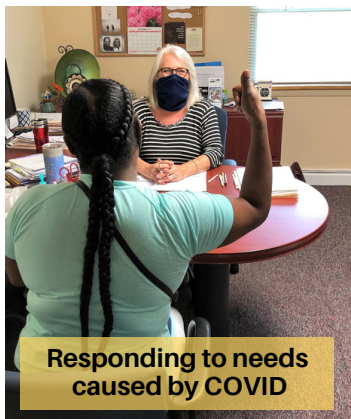
Responding to needs caused by COVID

It was a year like no other! The staff of Neighborhood Housing Partnership readily adapted to provide services while wearing masks, and Zoom meetings became a common occurrence. Many of us had family members and friends affected directly by Covid-19. All of us have been impacted by it ... and forever changed.